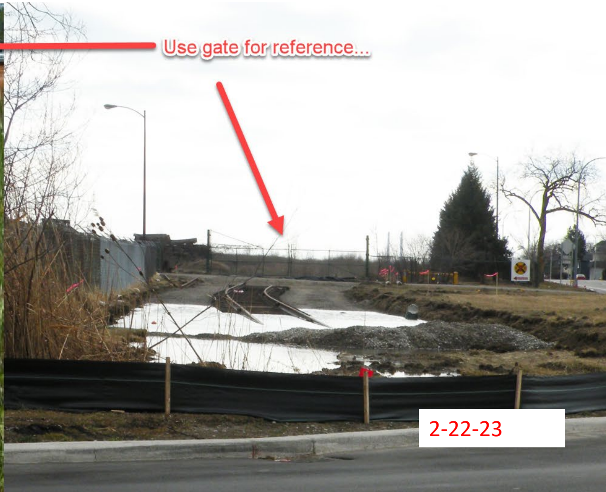
Side-by-side comparison from 2009 EPA response to 2/22/23 photo. The recent photo initiated our current response.